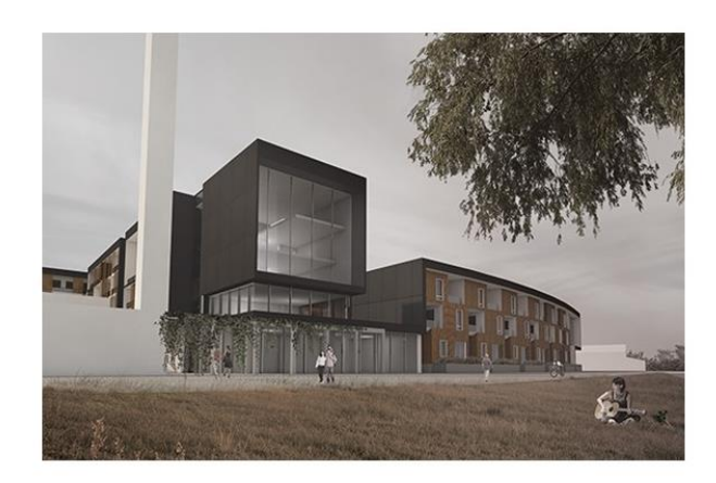
Figure 5. The ZUG Theater and a student project for social housing