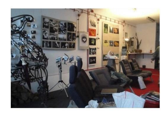
Figure 4. Flacăra factory and its artistic usage