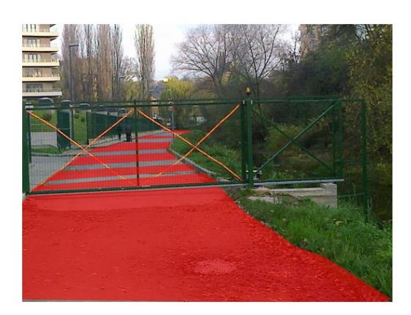
Figure 3. The Central Park Ensemble and the appropriation of Watermill's Chanel