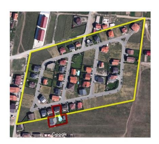
Figure 2. Private extension of the Terra Progresio gated community (<a href="http://www.terraprogressio.ro/preturi/harta.html">http://www.terraprogressio.ro/preturi/harta.html</a>) (Google Maps)

However, here will be presented another case of hard gentrification, but this time gated urban: the Central Park Ensemble, as seen in Figure 3. As in the suburban type mentioned above, the gated community tried to enlarge its territory by swallowing the neighboring space and placing an illicit gate, outside their territory: in this case the banks of the Watermill's Chanel (Canalul Morii), a